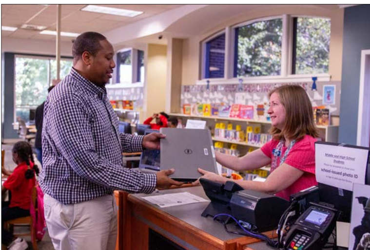
BELOW LEFT: Georgia's public libraries started checking out laptops to patrons during the pandemic, assisting students and workers in completing their work during a difficult time. The demand has grown steadily, and GPLS is pleased to have provided more than 7,000 Chromebooks to libraries in 2023.