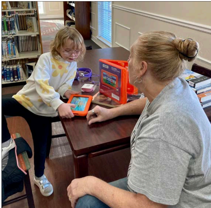
A volunteer tutor helps a student using a Launchpad at Worth County Library, which received 13 Launchpads from GPLS.

Georgia Public Library Service (GPLS) has provided more than 7,000 Chromebooks and 2,800 Launchpad learning tablets for children to public libraries across Georgia as part of $2.3 million Governor's Emergency Education Relief (GEER) funds awarded by Gov. Brian Kemp.