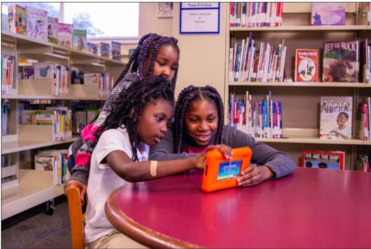
LEFT: Kids test out a Launchpad at the South Columbus Public Library. Parents there have shared that they love that this is positive screen time with the preloaded, interactive, learning content. An internet connection is not required, so the content is secure.